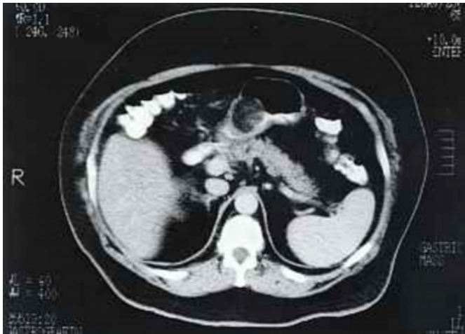
Figure 2. CT scan of the abdomen showing the gastric mass

The patient was scheduled for resection of the gastric mass and cholecystectomy. In the interim period before surgery his hemoglobin and hematocrit decreased to 10.4 and 31.4, respectively. At laparotomy, no other masses were found in the abdomen except for a very soft, rounded mass in the gastric antrum. The stomach was opened on the greater curvature and an ulceratous lesion was located overlying the mass. The mass was located between the serosa and submucosa. Upon inspection, it was evident that the overlying mucosa had broken down and ulcerated into the