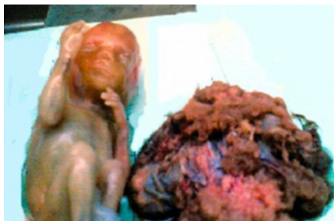
Figure 2: Image of fetus and placenta in ruptured cornual ectopic pregnancy at 18 weeks' gestation