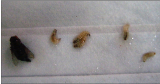
Figure 2: showing five maggots removed along with a dead fly.

Patient was put on amoxicillin 250 mg t.d.s along with topical antibiotic drops for ten days. On follow-up no maggots were visualized and patient relatives were advised to maintain hygiene.