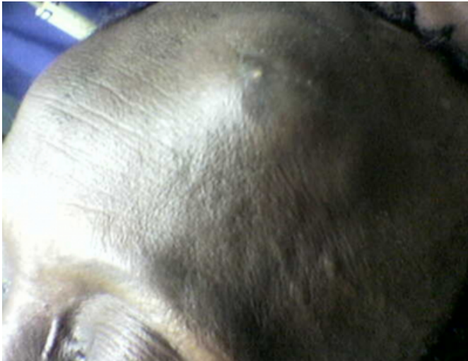
Figure 1: Preoperative finding of a frontal mass with a punctum.