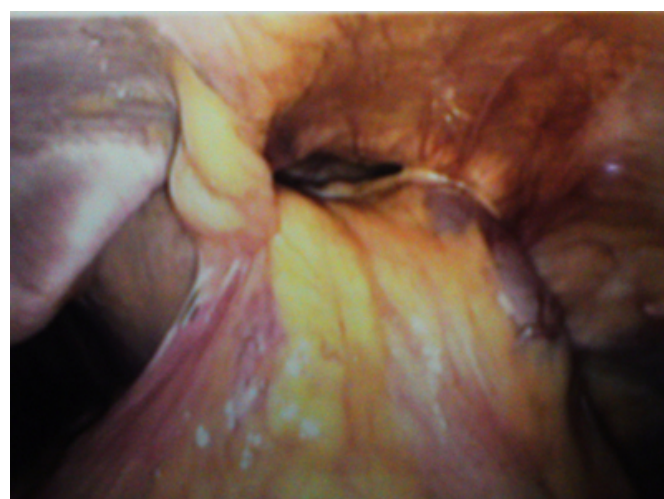
Figure 1 – Morgagni hernia defect containing loop of transverse colon