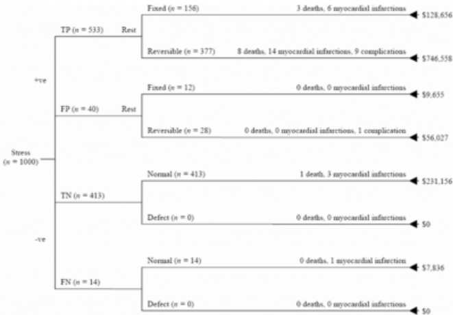
Figure 3: Decision tree analysis for rest only when stress is abnormal with a total of 12 deaths, 24 myocardial infarctions and costs of $1179889. True negatives (TN), false negatives (FN), true positives (TP) and false positives (FP).

The decision tress analysis for the cohort where rest studies were only performed if the stress study was abnormal (figure 3) demonstrated a total of 12 deaths, 24 myocardial infarctions, 10 complications and a total cost of $1179889. Three deaths and six myocardial infarctions were associated with true positive (TP) studies presenting with a fixed defect. Eight deaths, 14 myocardial infarctions and three complications were attributed to TP studies demonstrating a reversible defect and who underwent coronary angiography. One death and three myocardial infarctions were associated with the true negative (TN) group.