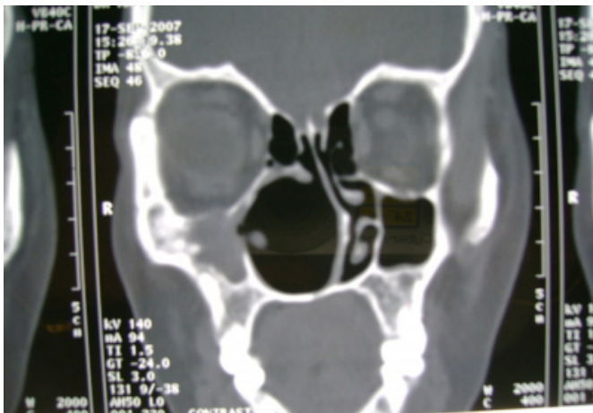
Figure 3: A CECT-Scan of the paranasal sinuses (Coronal view) showing the right maxillary sinus mass.

The patient underwent excision of the mass via a sublabial approach and the entire mass was removed in toto. On gross examination it was a 2 X 2 cm pinkish well circumscribed firm smooth mass. Histopathology revealed it to be a leiomyosarcoma that was confirmed by special stains (actin and vimentin).