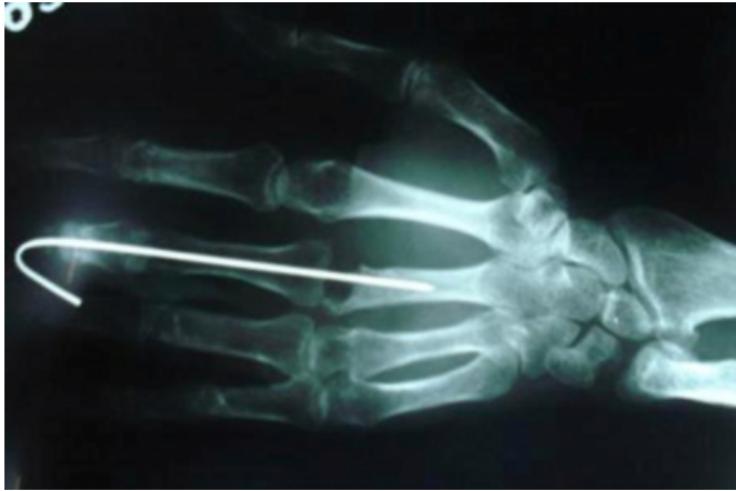
Figure 2: Radiograph shows a lytic lesion at the head of second metacarpal with the wire in situ.

Wound was debrided and sent for histopathological and microbiological examination. A wire was put for the proper alignment of bone. On direct examination fungal spores were seen but there was no growth on culture. Histopathological examination showed fibrocollagenous tissue containing several granules that on close examination showed fusiform, pseudoseptae, branching hyphae along with spores. (Figure 3).