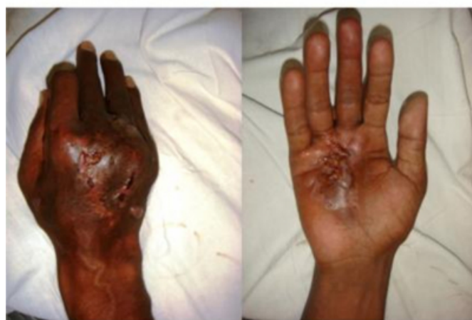
Figure 1: Dorsal and ventral aspect of hand showing swelling and discharging sinuses through which black colored grains were discharged.