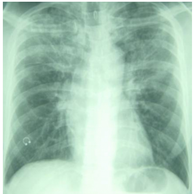
Figure 1: Chest radiograph one week before presentation showing interstitial infiltrates.

On the admission physical examination his temperature was 38.5°C, heart rate was 140 beats/min, respiratory rate was 40 breaths/min, and oxygen saturation was 70% on room air. Skin and mucosal surfaces were free of any lesions. Chest auscultation revealed diffuse bilateral crackles. The cardiac and abdominal exams were unremarkable. The neurological examination was normal. White blood cell count was 19,800 /ml 3 . Blood chemistry and hemoglobin level were normal.