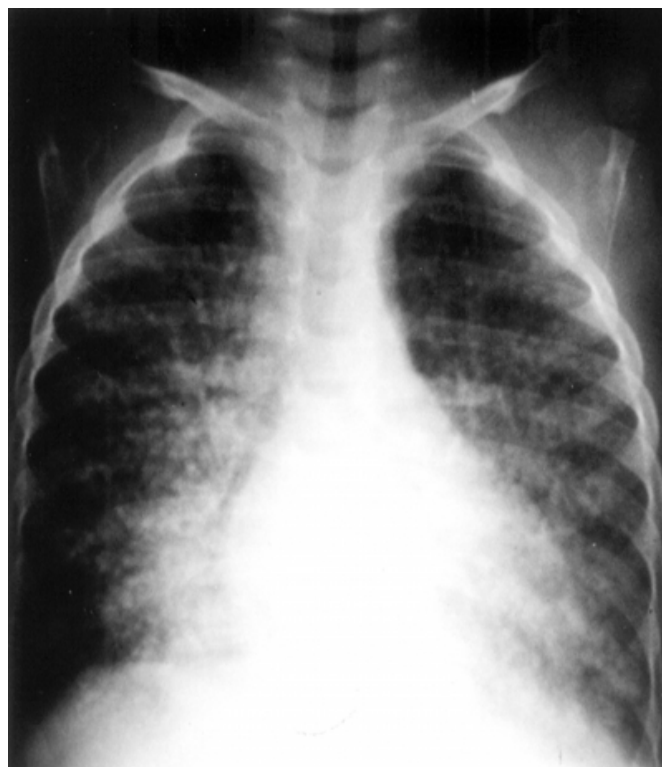
Figure 2: CXR of miliary TB in HIV-infection

There is no easy answer to the diagnostic dilemma, but it is important to ascertain the appropriate specimens and also consider more disseminated forms of TB in HIV-infected children, such as abdominal TB, tuberculous meningitis (TBM), miliary TB. A thorough history of potential household contacts and travel to TB endemic countries is essential. The use of Bactec culture bottles specific for mycobacteria should be encouraged, as HIV-infected patients have more evidence of dissemination of mycobacteria into the bloodstream ( 15 ), which might be picked up in the BacTec bottles - check for availability with your microbiology department. Table 1 summarises the list of investigations in the immunocompromised child with presumed TB.