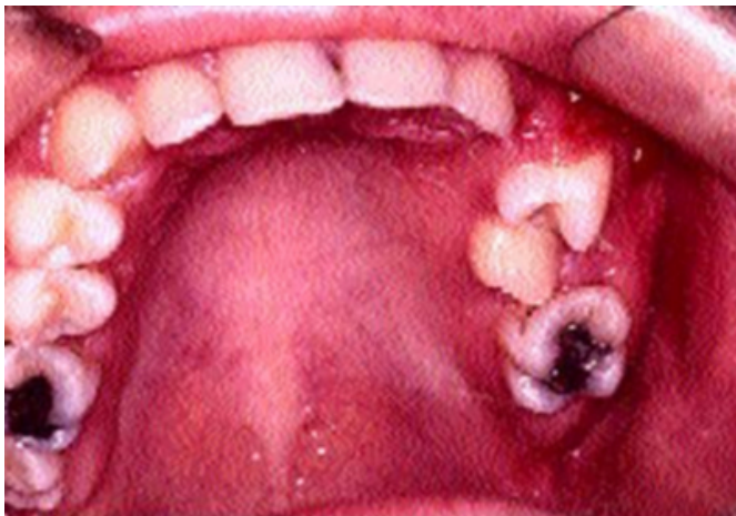
Figure 2: The amalgam fillings in the posterior upper jaw are important assessment features on victim identification.

In cases where the restorations were lost because of the circumstances of the death of the victim, these can be reconstructed with the use of amalgam/calcium hydroxide powder 18 . The radiograph that is being obtained after this restoration can be compared with the putative antemortem radiograph of the victim.