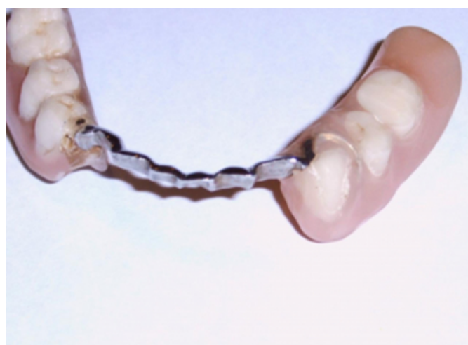
Figure 3: A partial denture without metallic labels or microchips.