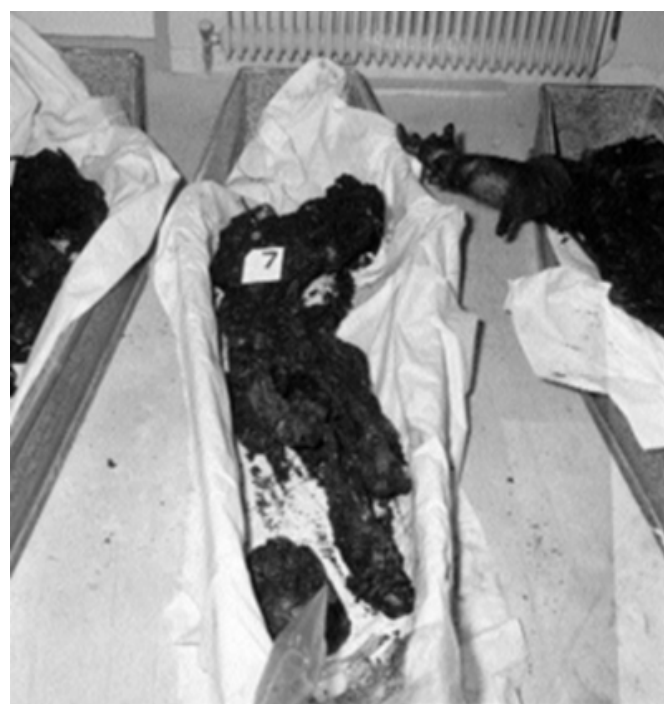
Figure 4: The process of identification is difficult due to excessive loss of tissues.