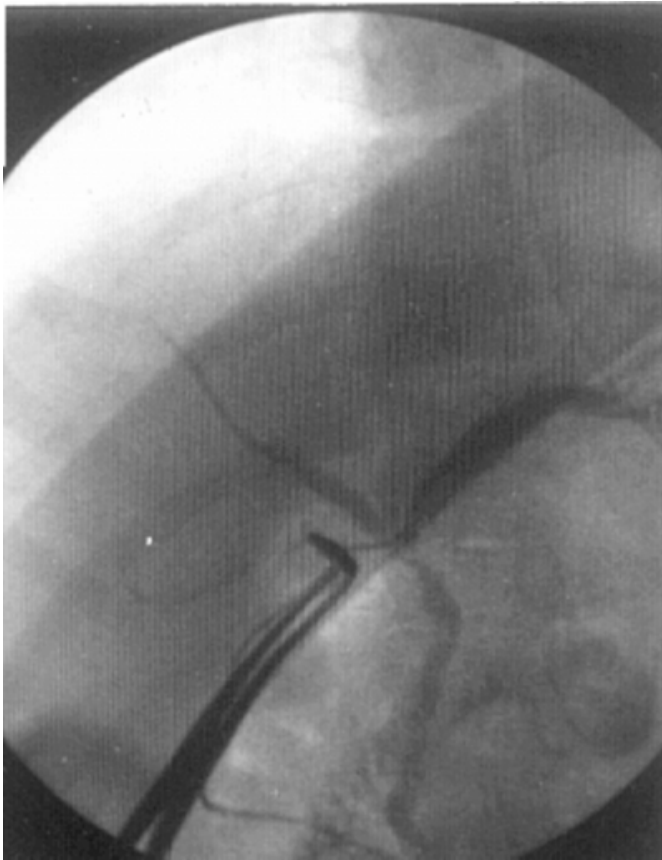
Figure 1: Intra-operative cholangiogram showing absence of the common hepatic duct. Note that both the right and left hepatic ducts are draining independently.

It revealed an absent common hepatic duct, with the right and left ducts draining directly into the gallbladder (Figure 2).