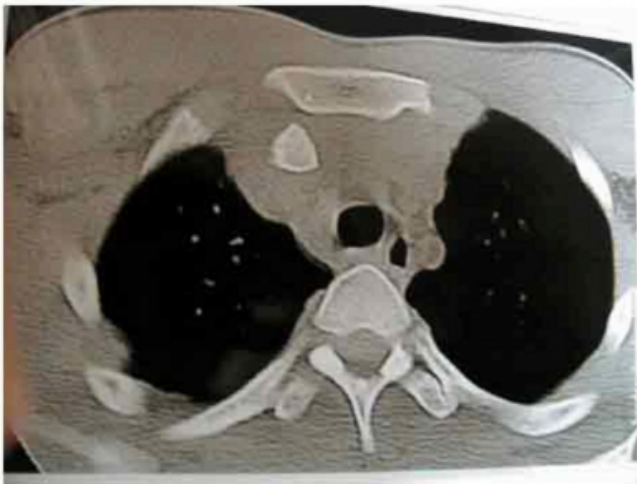
Figure 2.CT scan of the Sternoclavicular Joint revealing the posterior dislocation and the mediastinal oedema

Symptomatically the patient felt relieved and the dysphagia and dyspnoea settled. We assessed him 3 months after the trauma when the patient was completely asymptomatic and the CT scans revealed partial reduction of the medial end of the clavicle (Fig.3).