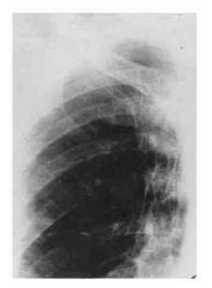
The CT scan revealed clear signs of bullous emphysema mainly in the upper lobes. Alpha-1-antitripsin levels were normal. The functional respiratory tests showed a slight

Figure 1: Chest Rx showing notching in the lower margin of the posterior aspects of the 4th and 5th right ribs.