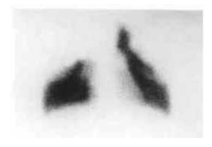
Figure 2: b. A perfusion lung scintigram in anterior projection revealing perfusion absence in the right upper pulmonary lobe