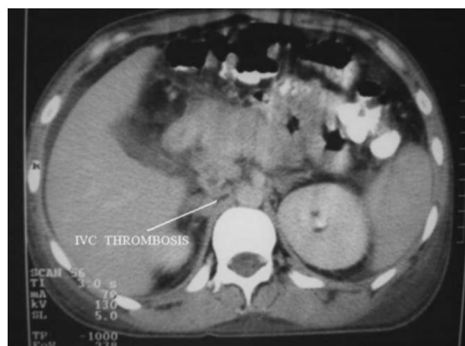
Figure 2: Abdominal Computed Tomography Showing An Inferior Vena Cava Thrombus Along With A Bulky Pancreas And Ill-Defined Peripancreatic Fat Planes.

The patient was managed conservatively with nil orally, nasogastric aspiration, intra-venous fluids, antibiotics and analgesics. Intravenous heparin was started at the dose of 5000 U 6-hourly with further dose adjustment maintaining an activated partial thromboplastin time between 50-80 seconds for five days.