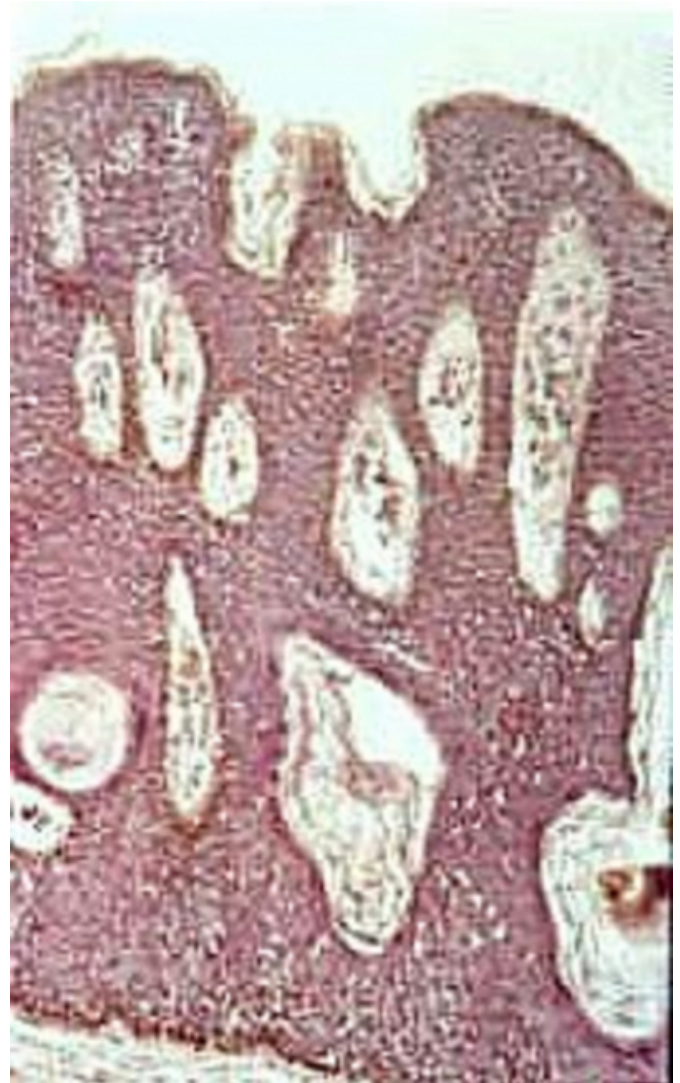
Figure 4: True and pseudo cysts