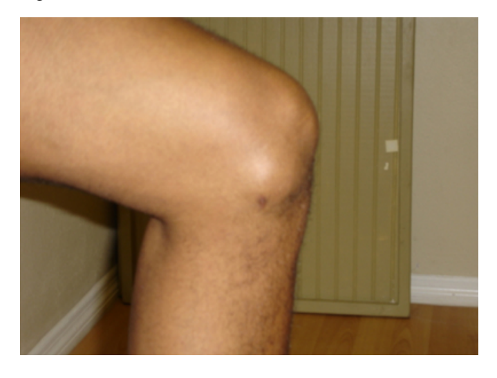
Figure 1 Figure 1

The overlying skin was normal and the lump was non tender, it was not attached to the skin but felt tethered to the deeper tissues. The lump was not pulsatile but was transilluminable in a bright light.