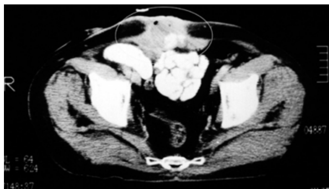
Figure 1: Computerized axial tomography slice of the tumour. CT revealed partial calcification within the mass. (Ellipse shows tumour in abdominal wall).

In January 1995, after surgical removal and abdominal wall reconstruction by rectus femoris flap, the mass was sent for pathologic examination.