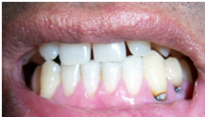
Figure 2: Photograph showing root caries in 33 & 34.