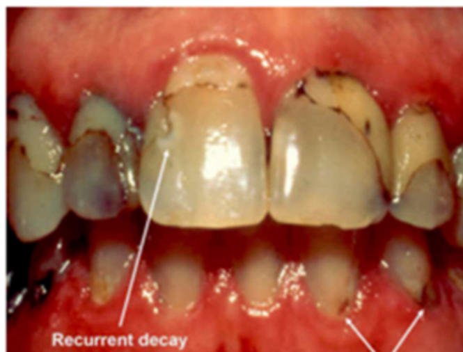
Figure 1: Photograph showing recurrent caries on 11 & root caries on mandibular teeth.

Root caries most often occurs supragingivally, at or close to (within 2 mm) the cemento-enamel junction. This phenomenon is due to the location of the gingival margin at the time conditions were favorable for caries to occur. The location of root caries has been positively associated with