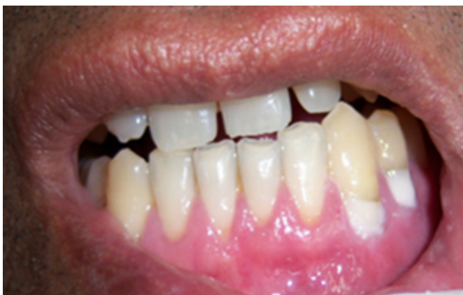
Figure 4: Teeth restored with Glass Ionomer filling.