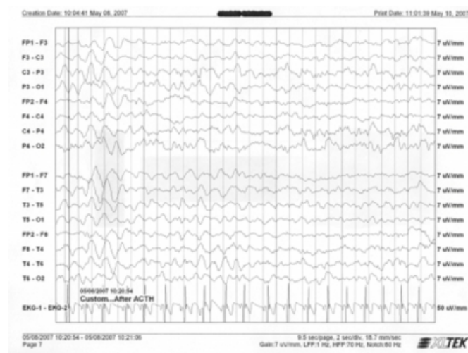
Figure 2: Normalization of the EEG 10 days after initiation of ACTH therapy.