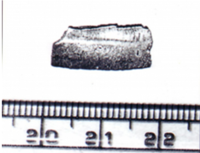
Fig. 2 Steel piece after endoscopic removal

Foreign body in the sinuses can extend intracranially or introrbitally 4 . Organic foreign bodies are capable of acute reaction like purulent inflammation, abscess formation, gangrene, tetanus and chronic reaction like granulomatous reaction, fistula formation and osteomyelitis. Inorganic foreign bodies usually cause little inflammatory reaction and are well tolerated, with the exception of copper 2 . Sometime it may cause rhino sinusitis, rhinolith, neuralgia like symptoms and rarely malignancy 1 . Type, site, size, extension and associated complication of the foreign body needs to be assessed in the management. Foreign bodies which are organic, copper, and which impair function of sinuses and orbit should be removed.