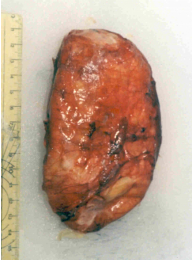
Figure 2: Specimen of cyst hydatid

Diagnosis of primary extramuscular hydatidosis in the thigh was made. Postoperative courses have been uneventful.