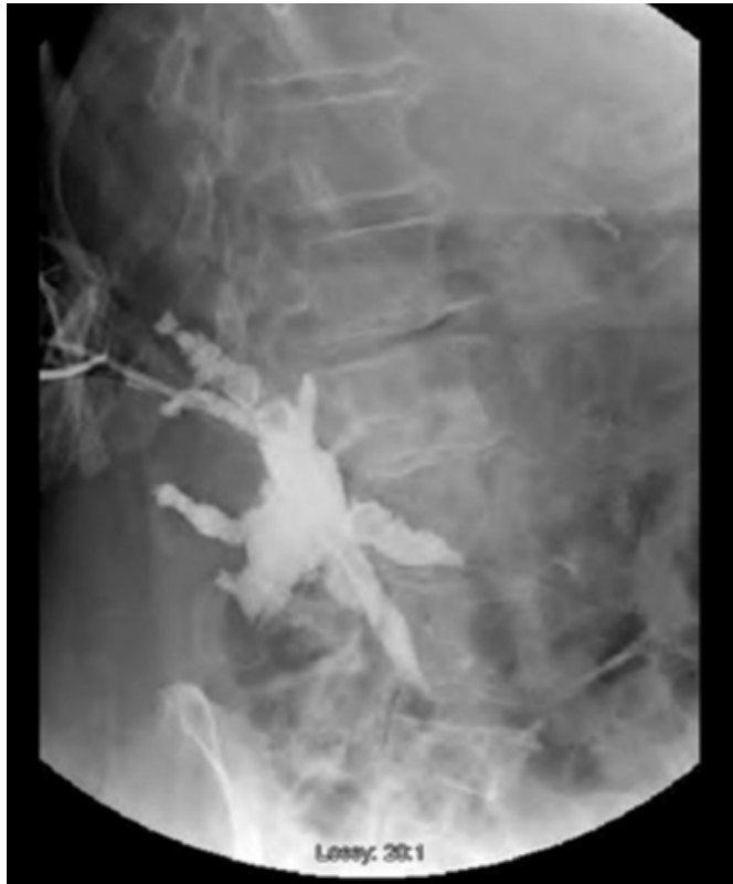
Figure 2: Pre-operative sinogram of right flank showing a complex, stellate shaped sinus below the skin. The contrast material did not enter the intra-abdominal cavity or communicate with any intra-abdominal structures.

Based on the imaging findings, we proceeded to surgically explore the sinus tracts and the cavity containing the embedded gallstones via a right lateral approach. Intraoperatively, a cavity containing two black gallstones, 0.8-1.0 centimeters in size, was located deep to the tip of the twelfth rib (Figure 3). The gallstones were retrieved, chronic scar tissue was debrided, and the fistulous tracts were opened widely to allow for adequate drainage. A negative pressure wound therapy device was applied to aid in post-operative healing. The patient tolerated the operation well and was discharged home from the hospital the following day. Office follow-ups showed the wound to be resolving adequately without evidence of ongoing infection.