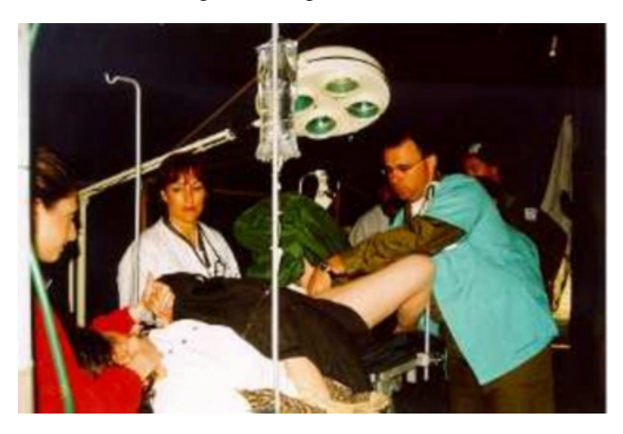
Figure 5: The operating theater becomes a delivery room with some of the lights coming from CNN cameras

As it was very cold, it was necessary to keep the newborn babies in a warm environment – until we brought a modern incubator from Israel, we build a home made incubator. The operating theater becames a delivery room and the big tent – a pediatric department.