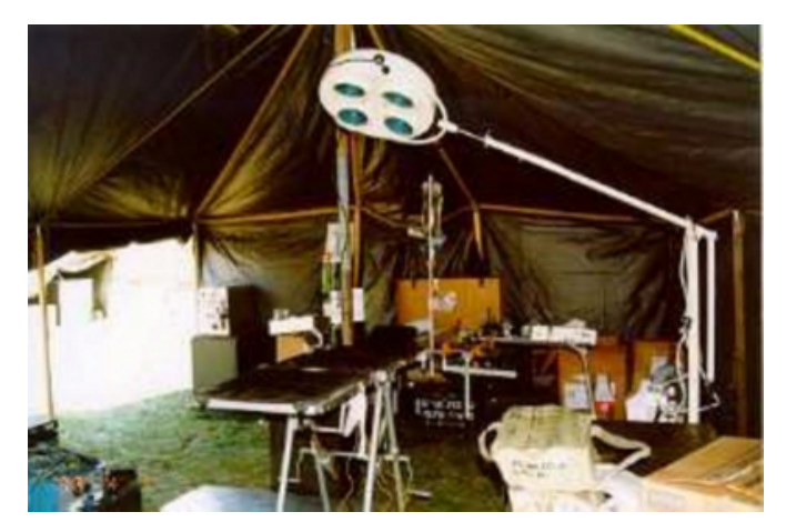
Figure 2: The Israel Defence Force (IDF) operating theater

The medical help at the refugee camps was provided by many civil organizations – volunteers from all over the world. By an international effort to help and not to destroy. Physicians speaking in 10 different languages were talking to each other and among the chaos there was humanity.