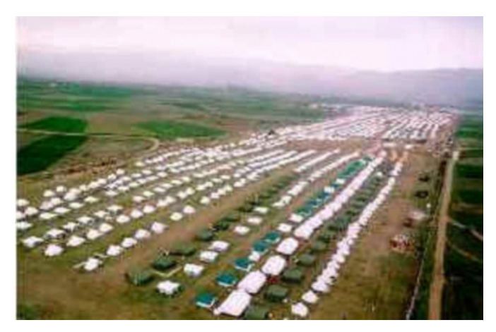
Figure 1: The Brazda refugee camp as seen from a helicopter

The refugees left everything at home including insulin, steroids and antihypertensive drugs. Our first mission was to supply them with the necessary drugs. (We brought some by air from Israel and bought from Skopie pharmacies all we could get).