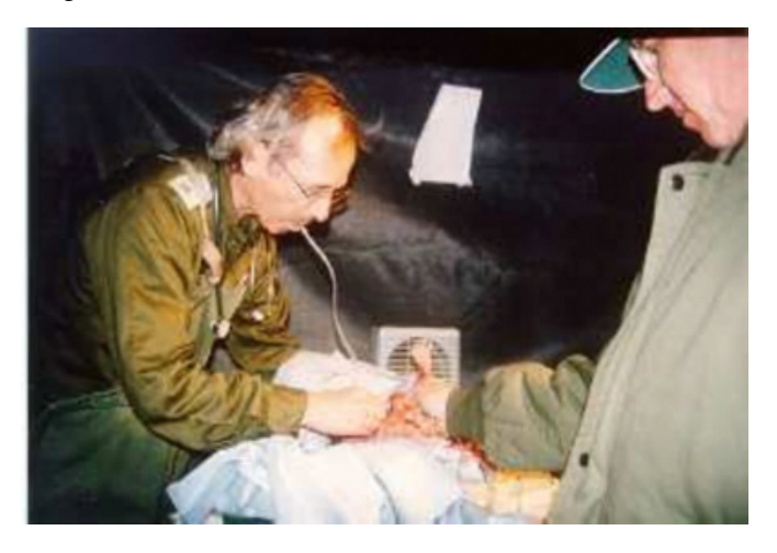
Figure 6: Baby CPR - note a simple heater and suction by the pediatrician