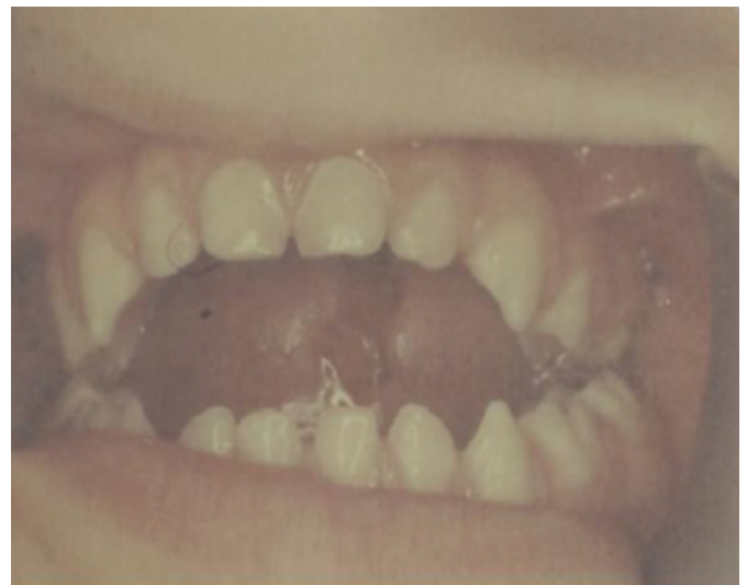
Figure 5: Anterior open bite

All relevant investigation were normal ,radiographic show the facial skeleton discrepancy .After long discussion with the parent about the child condition, a surgical correction option has been given to the parent.