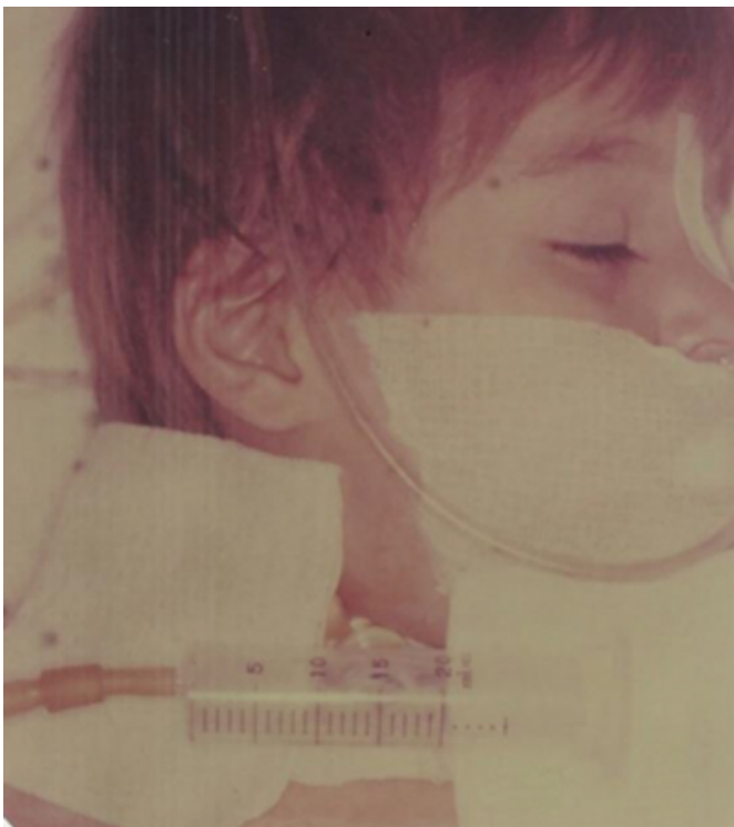
Figure 7: post operative view