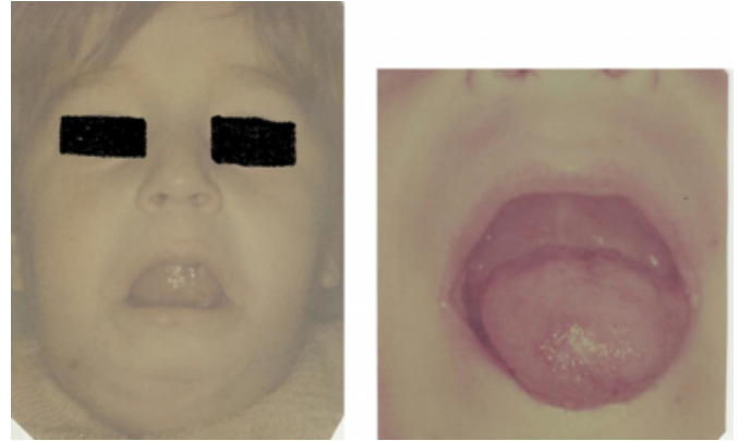
Figure 8 & 9: Two weeks post operative view