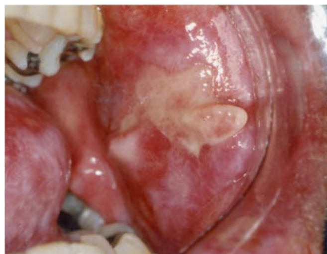
Figure 1: Lichenoid appearance of buccal mucosa.