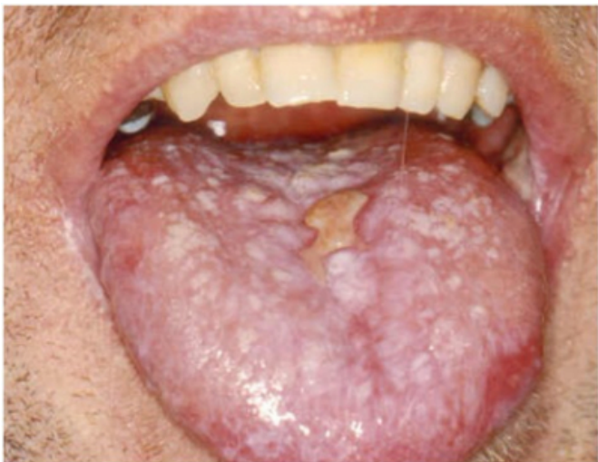
Figure 3: Ulceration and soft tissue mass on tongue.

An incisional biopsy of the buccal mucosa revealed an infiltrate of mixed chronic inflammatory cells, mostly lymphocytes and histiocytes within the connective tissue. There were no features of malignancy, however saw-tooth rete pegs and migration of lymphocytes into the epithelium was observed. These histologic findings were consistent with cGvHD. Biopsies of the three exophytic masses demonstrated exuberant reactive granulation tissue interspersed by distended capillaries and fibroblasts. There was a moderately intense inflammatory cell infiltration present, and the surfaces were partially ulcerated and covered by a fibrinous exudate. Our clinical assessment based on the histopathologic findings was chronic oral GvHD and NGSTGs.