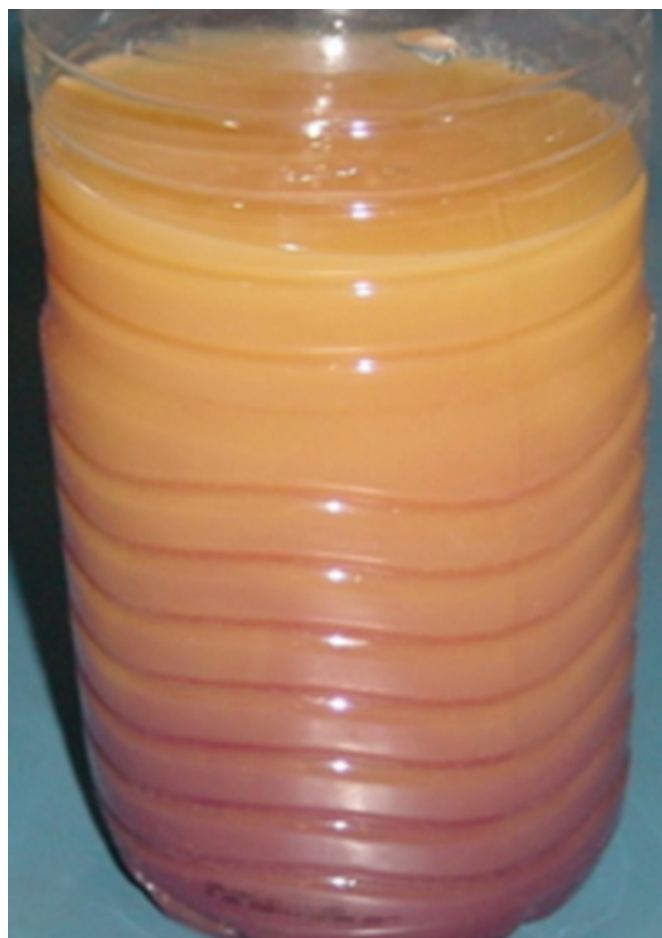
Figure 1: Chylous ascitic fluid