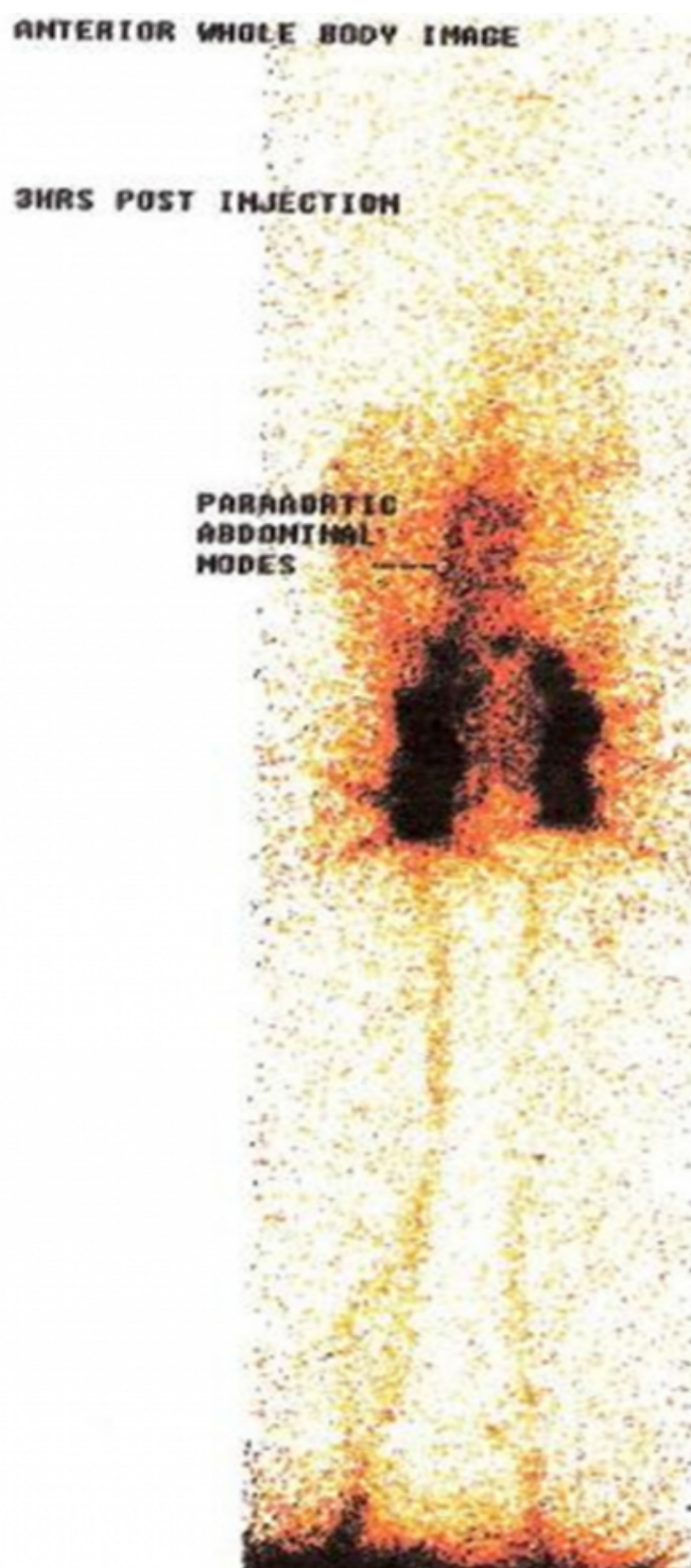
Figure 3: Lymphoscintigraphy showing a hold up of the tracer at the level of paraaortic lymph nodes with collection of the tracer in the peritoneal cavity.

Patient was started on Diethylcarbamazine (DEC) 300mg/day in 3 divided doses with pheniramine and hydrocortisone followed by a therapeutic pleural and ascitic tapping. An oral diet containing lipids in the form of