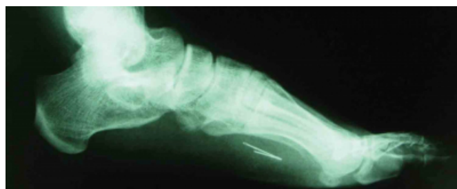
Figure 2: Lateral view of the roentgenogram.

A zig-zag incision was made on the medial plantar side of the left foot. Under flouroscope, the dissection continued through the deeper planes. There were no evidence either for a foreign body reaction or a capsule formation peripherally. Finally, an unexpected location, flexor hallucis longus tendon, revealed the foreign body within it (Figure 3). After the removal of the foreign body, the appropriate hemostasis