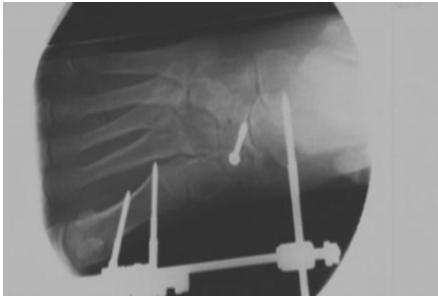
Figure 3: AP and Lateral post-operative films showing achievement of excellent articular reconstruction and alignment.