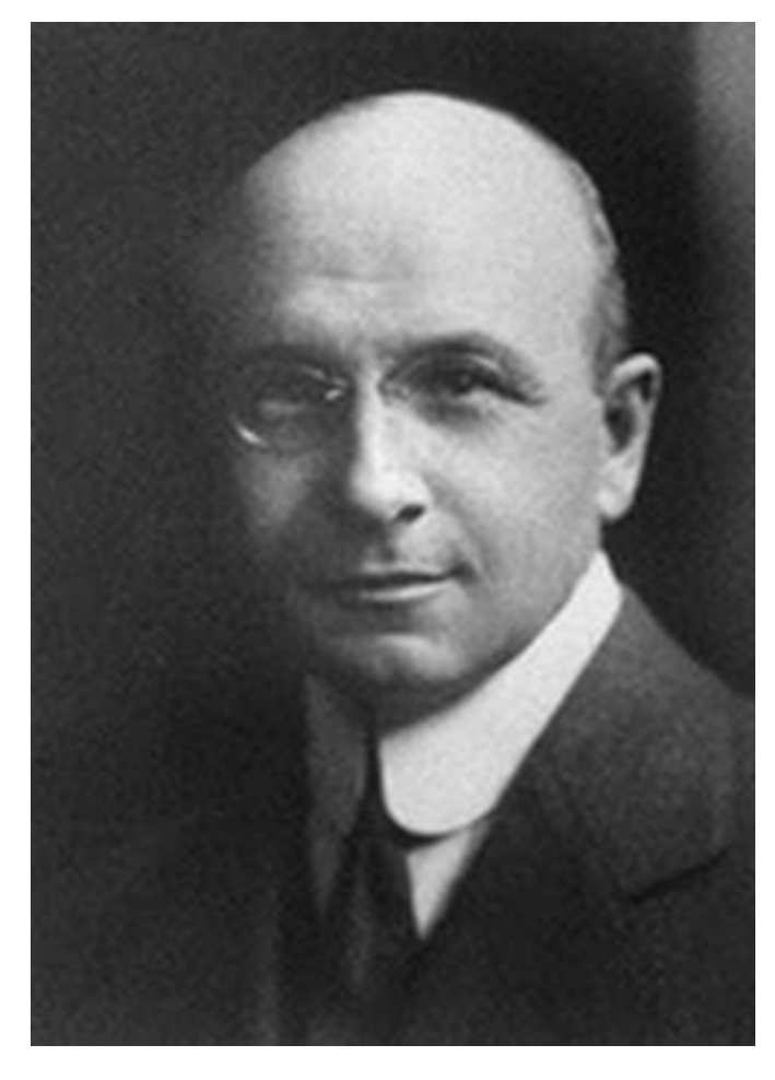
In 1890, Alexis Carrel was admitted to the Medical School

Figure 2: Photograph of Alexis Carrel, born on June 28, 1873, died November 5, 1944, French- American surgeon.