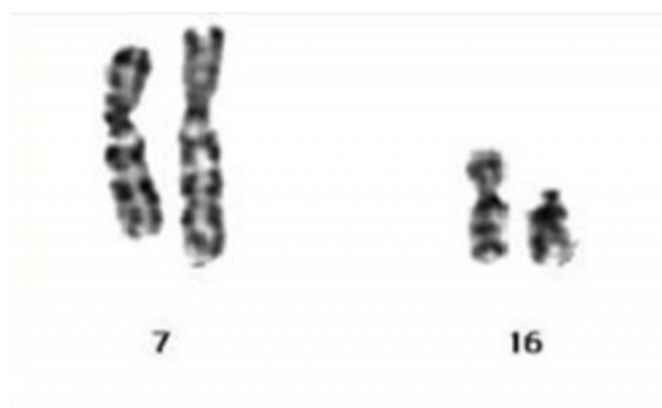
Fig. 2 : Partial karyotype showing the balanced translocation in the mother.