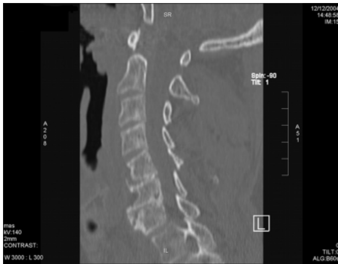
Figure 2: Initial Noncontrast CT image of cervical spine.

Based on the initial CT scan and radiograph, fracture or subluxation of the cervical spine was ruled out, with evidence of degenerative changes only. No MRI was performed at this point and, therefore, there was no evidence regarding the nature of any possible soft tissue injury. The doctors associated with the case questioned the likelihood of cervical spine injury versus degenerative changes of the cervical spine, but this was not addressed by the doctor again. Initial radiographic results indicated a posterior dislocation of the left femoral head, and the patient was referred to an orthopedic surgeon for evaluation and reduction of the left hip dislocation. The CT scan of all other systems was negative, and no other acute traumatic injuries were attributed to this patient.