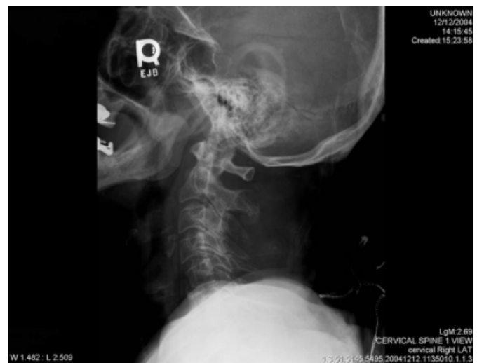
Figure 1: Initial lateral view cervical spine radiograph.