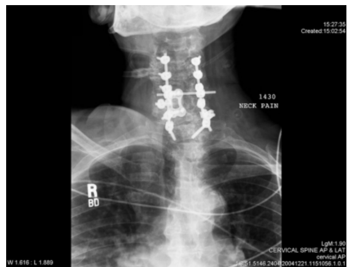
Figure 7: Radiograph following posterior fusion of C3-T1 of the cervical spine.