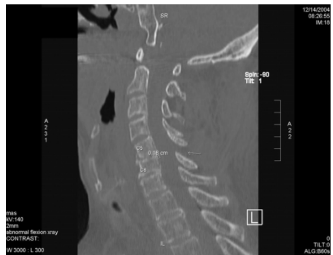
Figure 5: Repeat CT scan following reduction from C5-C6 dislocation.

Later that same morning, the patient continued to complain of generalized weakness and numbness but stated that his arms were much improved. He was found to be weaker in his right upper extremity than his left. The physician stated that the patient complained of generalized numbness in his arms, but that his symptoms had decreased and he was much better. The physician stated that the patient's cervical spine was immobilized, that his pupils and extraocular movements were intact, and that his face was symmetric. Further musculoskeletal examination revealed that the patient was able to use both upper extremities, and that the gross strength in the right upper extremity was 4/5, with the right hand at only 3/5. The patient's left hand function was 4/5 to 5/5, with the gross strength of the left upper extremity a 4/5 or 5/5. Right lower extremity strength was tested and considered to be 4/5 to 5/5. The patient's left leg was placed in long leg traction secondary to multiple trauma, and therefore was not tested. The patient was able to dorsiflex and plantarflex the feet and had good sensation and joint position sense bilaterally. Following review of all films and musculoskeletal exam, the patient was recommended for stabilization surgery of the cervical spine and was transferred to the intensive care unit. The decision was made to hold off on acetabular surgery until the cervical spine was stabilized with surgery.