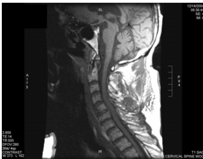
Figure 4: MRI of cervical spine following reduction from C5-C6 dislocation.

A post-reduction CT scan of the cervical spine revealed sclerotic degenerative changes and narrowing at C5-C6, with a 2-millimeter retrolisthesis of C5 on C6. There was a widened separation between the spinous process of C5 and the superior portion of the spinous process of C6, of which the body was compressed by 20 percent. A small fragment of bone was noted dorsal to the interspinous distance between C5 and C6, consistent with an avulsion fracture of the C5-C6 spinous processes, and suggestive of a disruption of the interspinous ligament. Finally, there were nondisplaced fractures of the bilateral C5 facet joints. (See Figure 5.) When a comparison was made to the initial, pre-dislocation CT scan, images were considered similar, and both were consistent with hyperflexion injury of the cervical spine.