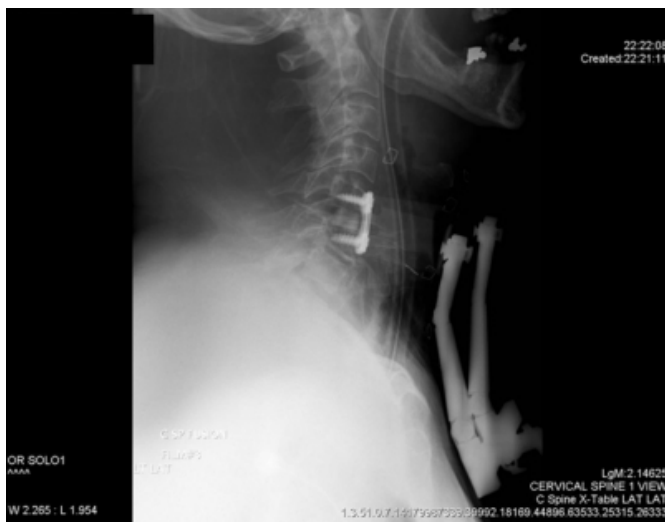
Figure 6: Radiograph following anterior fusion of C5-C6 in the cervical spine.

Following surgery, a Philadelphia collar was placed on the patient. Conclusions regarding the nature of injury noted from the anterior approach included an endplate fracture and an epidural disc herniation.