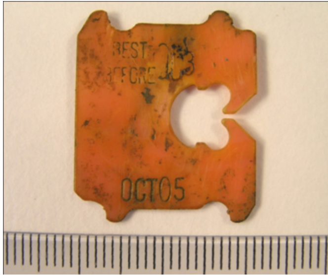
Figure 2: Close up of the ingested foreign body detailing the expiry date

Ingestion of bread clips make up an extremely small percentage of all ingested foreign bodies. To date there have been 24 cases of bread clips discovered in the gastrointestinal system 1 requiring different degrees of intervention. Unfortunately, as the patient is often unaware of ingestion and the clips are often not apparent on x-ray or CT, presentation often does not occur until a complication arises. There have also been documented cases of a bread clips being found incidentally during surgery or at autopsy 2,7,12 .