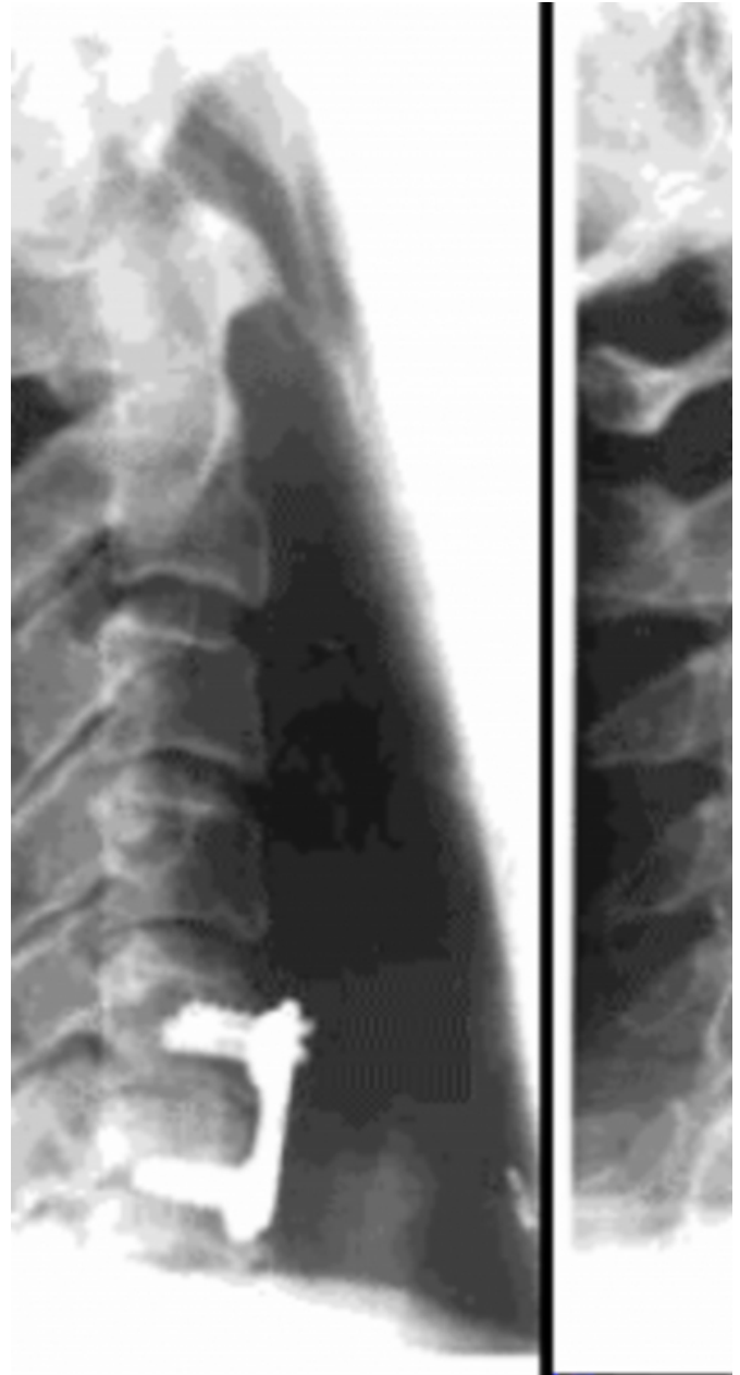
Figure 3: Following reduction by traction and internal fixation.