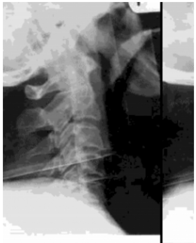
Figure 1: Lateral cervical spine radiograph at initial presentation shows no obvious abnormality.

Log roll of the patient demonstrated no abnormality in his axial skeleton - specifically no posterior neck tenderness. A 2 cm shallow laceration over his occiput was sutured. No other injuries were apparent. The patient was admitted to the Accident and Emergency Department Observation Ward in view of the late hour, history of alcohol ingestion and