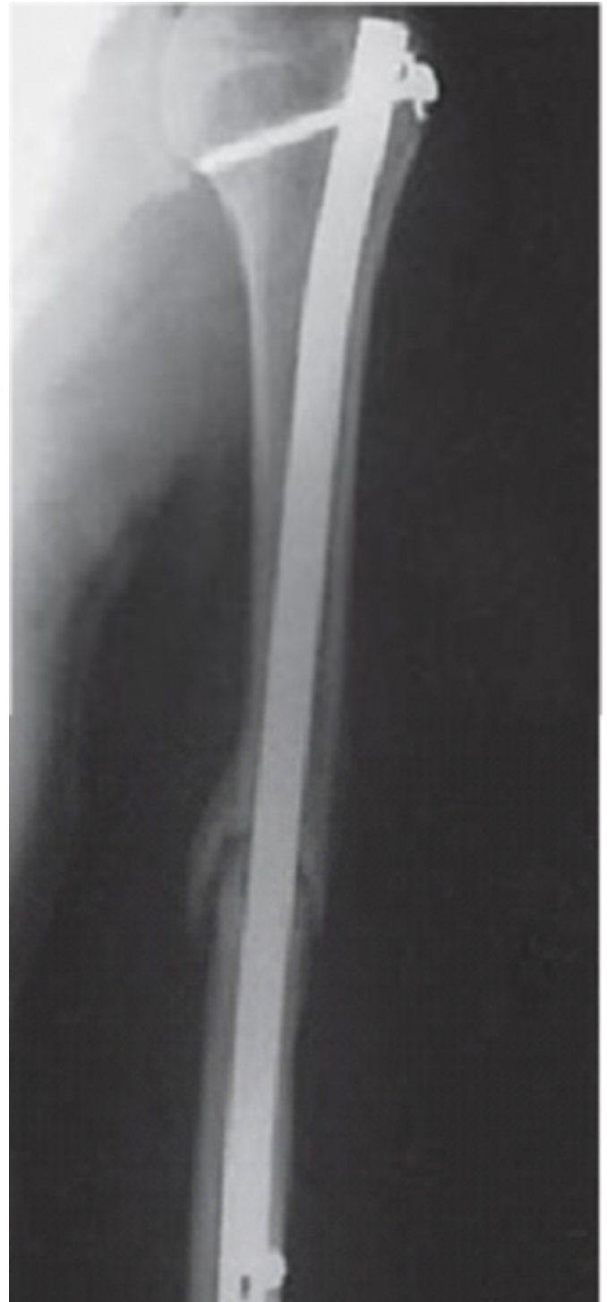
Fig 1: Non union of humerus after intramedullary nailing at 6 months.