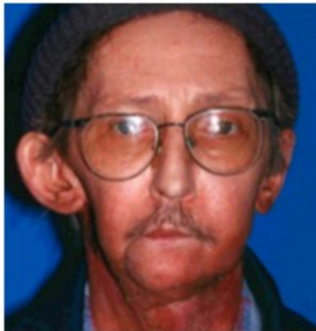
Figure 1: 54 year old man who underwent resection of a SCC to the tongue. He was reconstructed with a vertical rectus abdominis free tissue transfer for total glossectomy and partial pharyngectomy. The patient was treated postoperatively with 60 Gy of radiation therapy. Note the difference in ear protrusion with the right (radiated) being more prominent than the left (nonirradiated). No surgery on the ear was performed at the time of the original resection