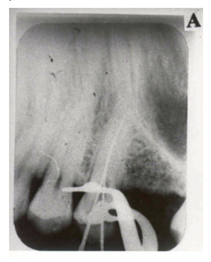
Figure 3 Figure 1A: Periapical radiograph of maxillary second premolar.

The fact that the Dentist should have adequate knowledge of the root and canal morphology of teeth requiring endodontic treatment cannot be over emphasised. Although in clinical practice it may be difficult to always identify these morphological variations on periapical radiograph, the radiograph shows only a two dimensional image of a three dimensional object. However, two periapical radiographs taken at mesial angulations to one another will reveal adequate information about the number of root canals (figs.1a and 1b) [ _{15} ]. The result of the correlation of the preoperative radiographic impression with clinical findings indicate a significant positive relationship (maxillary first premolars r = 0.6475, p < 0.001; maxillary second premolars r = 0.07307, p < 0.001).