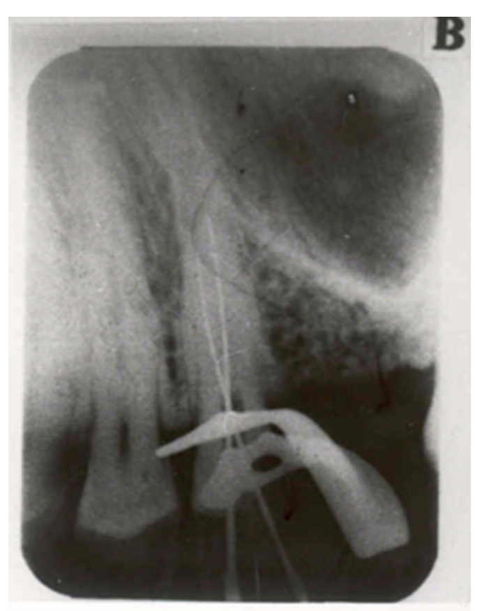
Figure 4 Figure 1B: periapical radiograph of same tooth in Figure 2A taking at mesial angulations, showing two separate canals.