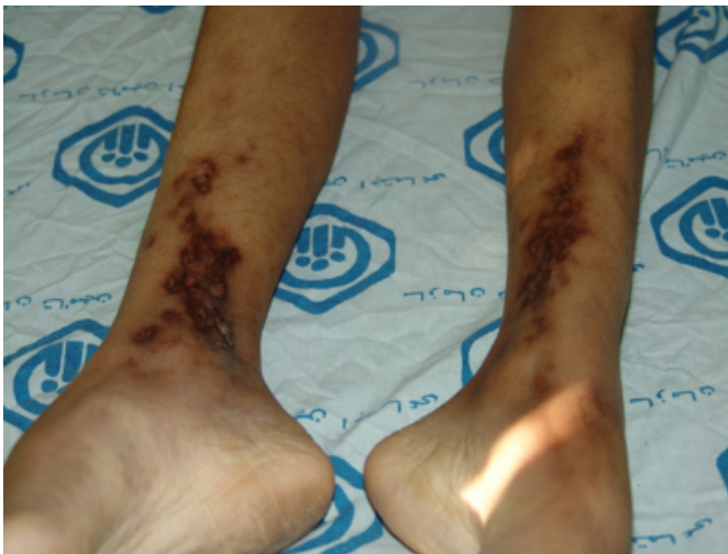
Figure 1: Ulcerated erythematous nodules on anterior surface of legs

On neurological examination, the patient was oriented, with intact memory and cognition. Fundoscopic examination was normal. The strength was 5/5 at the both hamstring and quadriceps muscles and 1/5 at the left anterior tibial muscle (sever foot drop), the motor power elsewhere was normal.