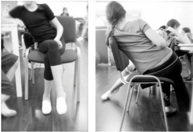
Figure 1. Correction of the activities of daily living in sitting position as performed within the SSTR Program. On the left a patient with double major scoliosis left thoracic is visible leaning to the right, opening the thoracic curvature and keeping the lumbar curvature corrected with this special position of the legs. On the right a patient with single right thoracic curvature is visible leaning to the left and by this opening the thoracic concavity. Details of this ADL correction are subject of the instructional courses given regularly.

The latest „Best Practice” program with a special methodology and a certain experiential learning approach is expected to be applied effectively within 3 – 5 days. The methodology was described in the 3rd edition of the „Best Practice” textbook (Weiss 2010).