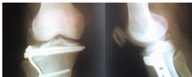
Figure 2: Post operative X rays (anteroposterior and lateral views)

The immediate post-operative evolution was without clinical and biological infection. Functional rehabilitation had been undertaken 15 days afterwards. At 1 year, the functional and anatomical evaluation had found a mechanical pain, a slight limping and a secondary depression of the elevated fragment (Figure 3).