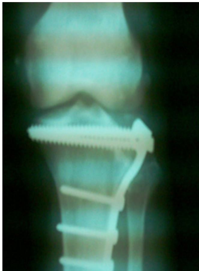
Figure 4: X ray control (anteroposterior and lateral views) at 3 years of retreat showing lateral tibial plateau necrosis

A material removal associated with a bone puncture was proposed but refused by the patient. It was lost sight of the fact thereafter.