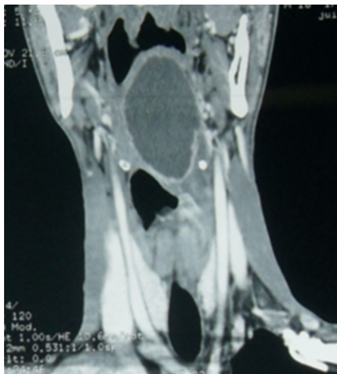
Fig 1: Computed tomographic scan (coronal cut) showing the collected pharyngeal abscess.