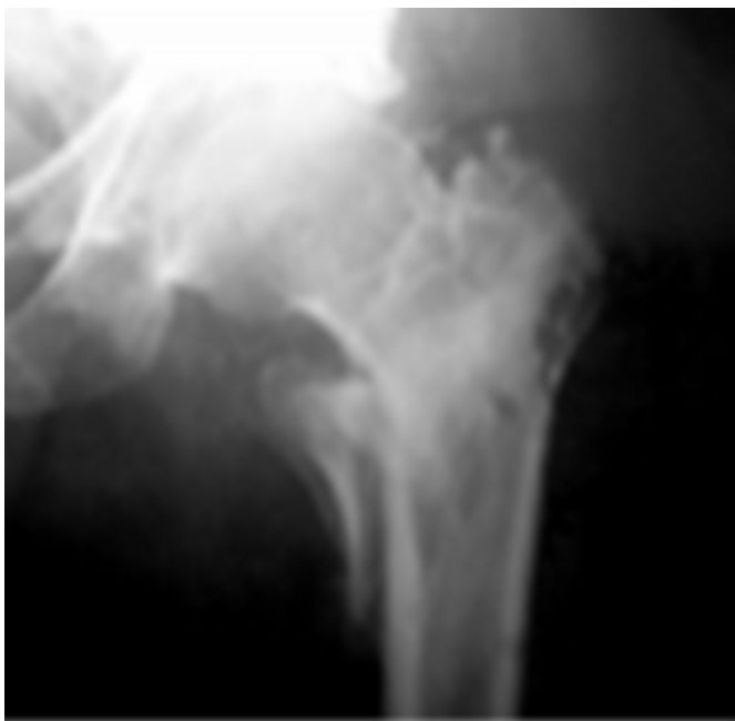
Figure 1D: United fracture after removal of External fixation.