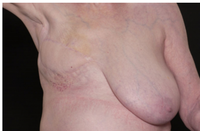
Figure 4: Recurrent reddish purple lesions of the skin at the right latissimus dorsi flap recipient site