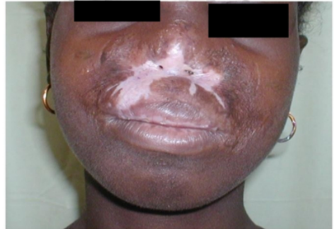
Figure 3: Tuberculosis cutis orificialis (TBCO)/lupus vulgaris (LV): After treatment.