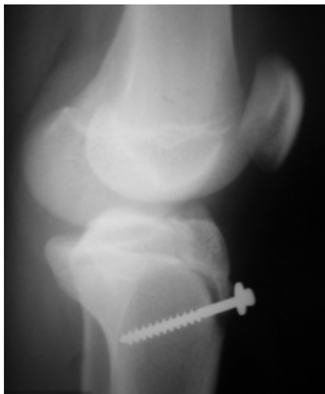
Figure 2: Post-operative. The fixation with screw solved the case. (Gaibor J. J, 2004)

The patient return to his daily and sport activities in complete normality after 10 months, without presenting further complains.