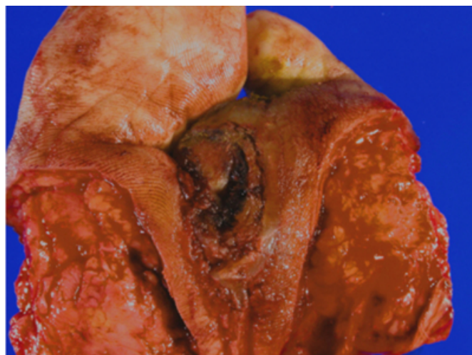
Figure 1: Ulcerated verrucous carcinoma of the plantar foot.

On microscopic examination, there was marked hyperkeratosis, papillomatosis, acanthosis, irregular elongation of the rete ridges with pushing type of invasion with bulbous proliferation of well-differentiated keratinocytes ( Figs.2 and 3 ). A diagnosis of a well differentiated verrucous squamous epithelial lesion suggestive of verrucous carcinoma was made. Surgical margins were clear.