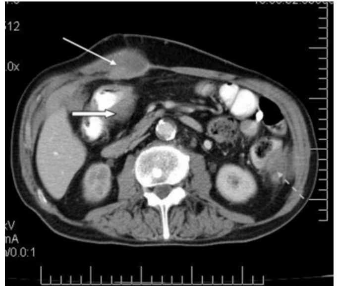
Figure 2: CT scan of the abdomen taken at 6 weeks postoperatively showing recurrence of the tumour in the right rectus muscle (white arrow), small bowel (solid arrow) and in the left iliac fossa (broken arrow).