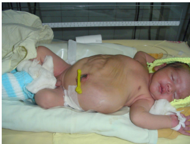
Figure 2: Picture of baby at birth showing abdominal distension

In the postnatal period the baby underwent ultrasound (Fig. 3) and CT scans and a diagnosis of “mesenteric cyst or retroperitoneal cyst or loculated ascites” was made. An aspiration was also done and report of which was non-specific. However, when a repeat paracentesis was done after starting the baby on oral feeds a white colored fluid was obtained. Biochemical examination revealed triglyceride levels of 957mg/dl. Finally a diagnosis of congenital chylous ascites was made. The baby was started on high protein, medium chain triglyceride and underwent paracentesis twice thereafter. The ascites began to resolve spontaneously and disappeared in 6 weeks. The baby has been on follow-up for 1 year and there has been no recurrence. He has a normal growth pattern and is on a normal diet.