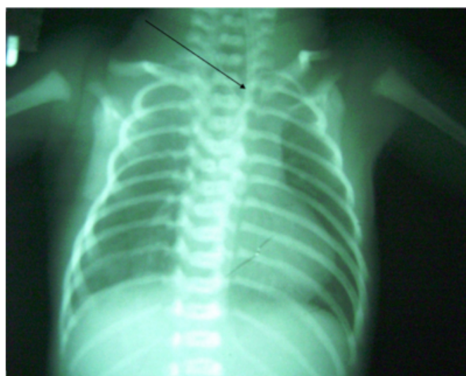
Figure 1: Plain X-ray abdomen & Chest showing gasless abdomen with coiled nasogastric tube in the esophagus

On examination respiratory rate was 64/min, cyanosis and signs of pneumonitis were present, feeding tube could not