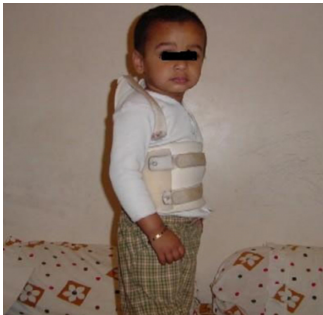
Figure 3: Child in Dorsolumbar corset

And planned to followed up child with repeat MR after 3 months. Child is comfortable with brace his pain has completely subsided. He has no other constitutional symptoms and his milestones are normal. Repeat MR shows posterior bulge into canal has cleared, and there is no further collapse or collection.