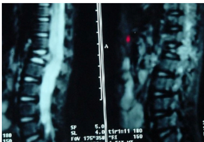
Figure 4: Follow up MRI shows posterior bulge into canal has cleared, and there is no further collapse or collection